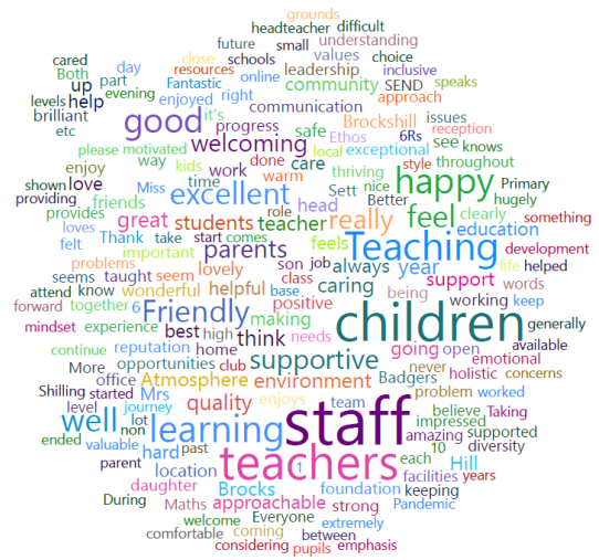
What do you most like about the school?

We also looked at things you said we could improve. This is what we have done far.